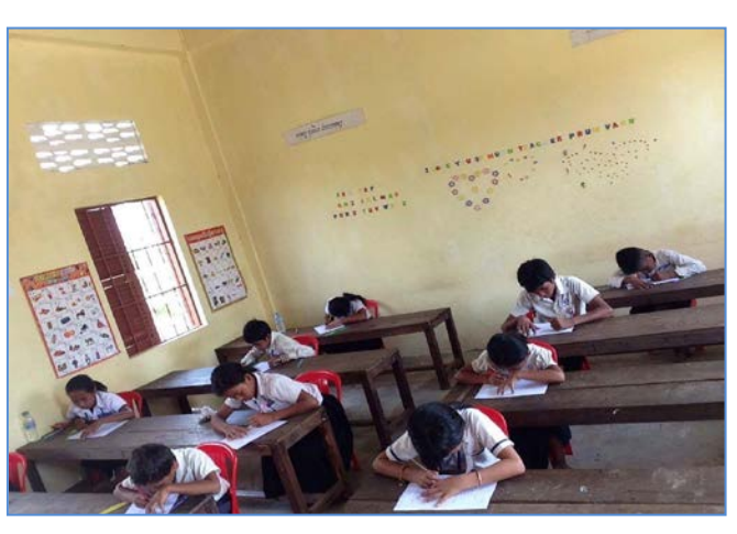
Students take their monthly exams