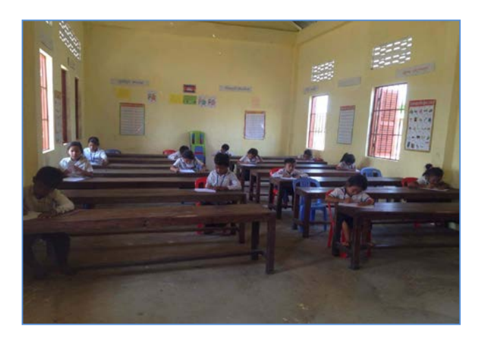
Students take their monthly exams