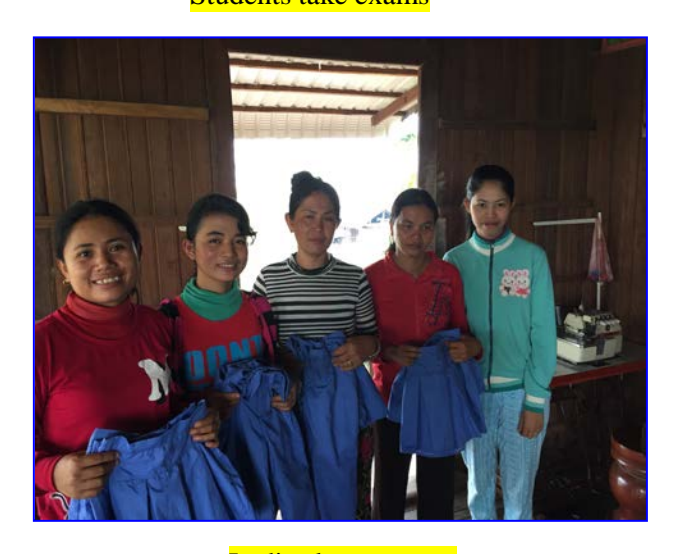
Ladies learn to sew