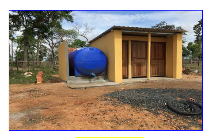
After Toilet Project