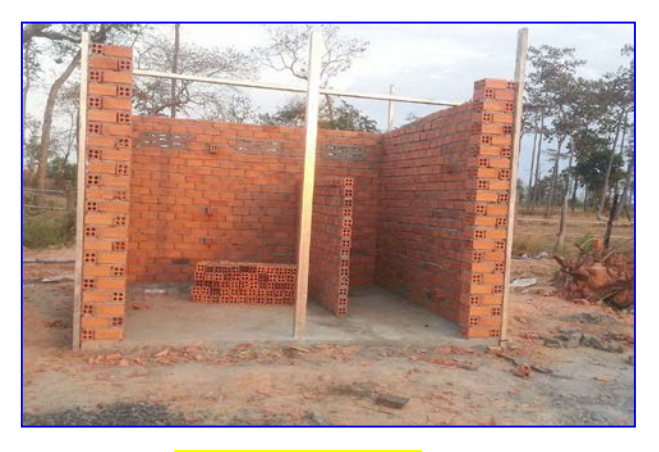
Before Toilet Project