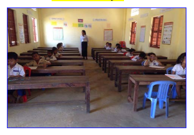
Students take exams